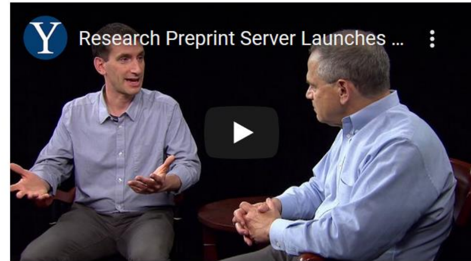
Coverage of the launch of medRxiv: